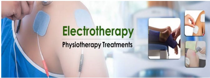
Electrotherapy Physiotherapy Treatments